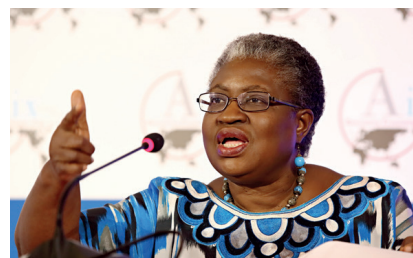
Ngozi Okonjo Iweala