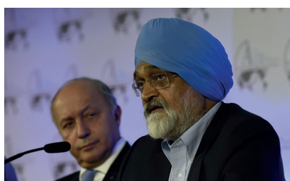
Montek Singh Ahluwalia